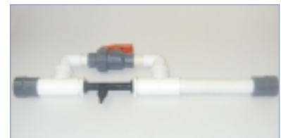
Mazzei® Injector Assembly